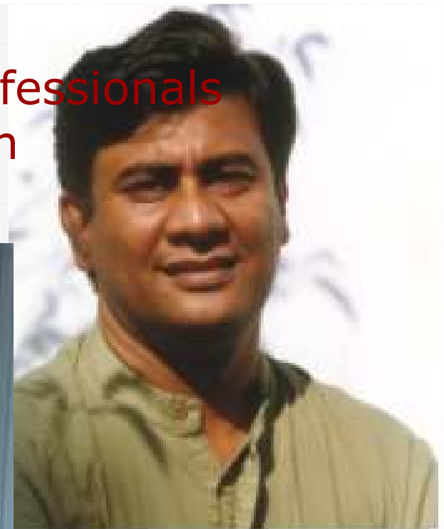
Filmmaker Tareque Masud decided to come back to Bangladesh to make films on his country of birth. His latest film Matir Moina won a prestigious award at the Cannes Festival.