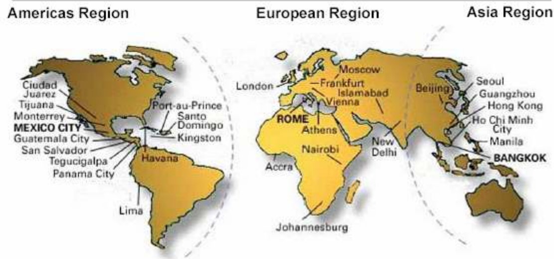
Map of USCIS Overseas Operations

• USCIS International District Offices are highlighted.